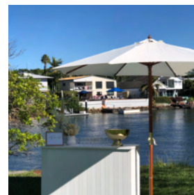
UMBRELLAS & PARASOLS