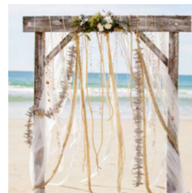
CANOPIES & ARBOURS